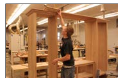
Jordan High School