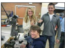
Brighton High School