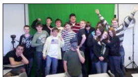
Box Elder High School