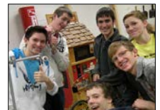
Timpview High School