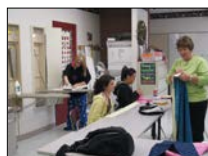
Mountain High School